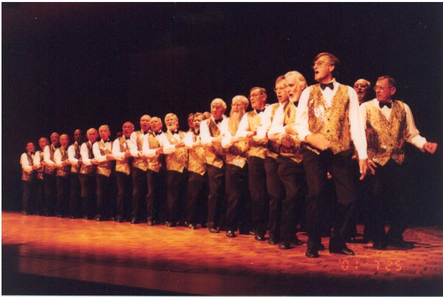
The chorus line-up for 'Tootsie'.