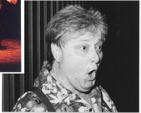
The heart-broken singers complaining about 'The Pub With No Beer'